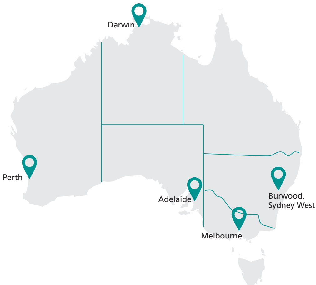
Moore Stephens Australia office locations as at January 2017

We recognise the importance to our clients of easy-access to high quality, professional advice. At Moore Stephens, close partner involvement ensures assignments are of the right quality, effective and efficiently managed while remaining highly visible to client management.